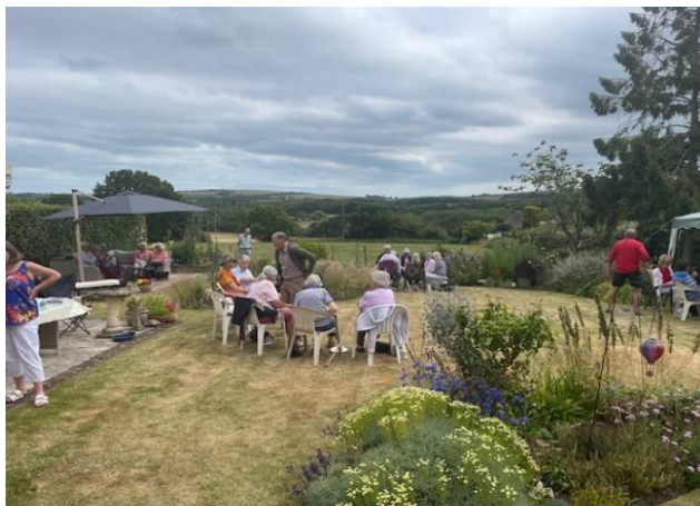
Well done everyone.

More Village Events Held so far this year.