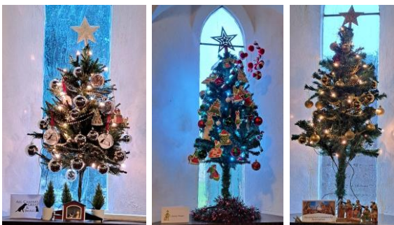
A sample of some of the Christmas trees on display.